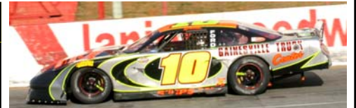
Greg Simpson SpeedFest 2009 Pro Late Model Winner